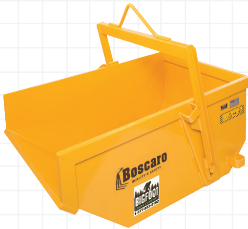
A-D Series Self Dumping Bins

Every Boscaro product is built to the highest standard and meets or exceeds ASME regulations. Call the Bigfoot Crane Company to learn how a Boscaro accessory will add value to your workplace.