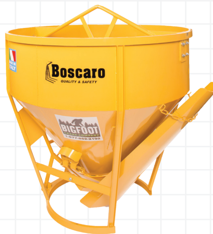
C-N Series Concrete Buckets