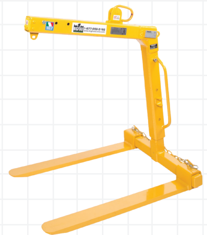
MBRA-E Series Pallet Forks