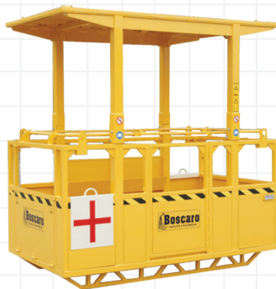
CPP Series Man Baskets